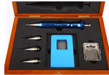
Weight : 140g / Length : 15.5Cm